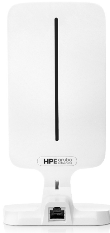
HPE Networking Instant On Access Points AP22D

Easily manage the HPE Networking Instant On AP22D with the HPE Networking Instant On mobile app or portal to create guest and employee networks, govern access control lists, and set POE schedules to customize power use. Make the most of your limited space in your small business by mounting the HPE Networking Instant On AP22D to a desk or wall with included mounting kits.