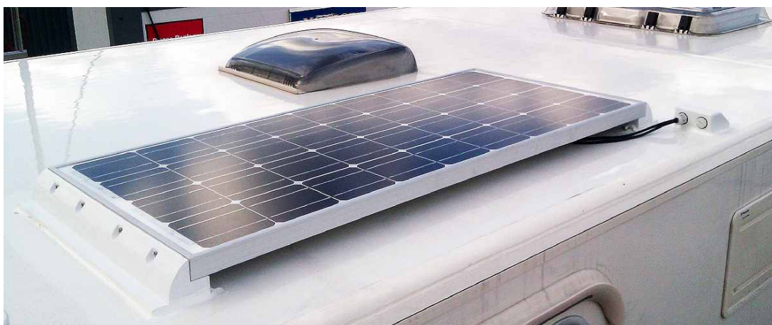
NETC Dual Waterproof ABS Plastic Solar Cable Entry Box, 1pcs per set

At some point the solar cables need to enter into a vehicle, shed, marine boat or caravan roof and down to the battery area. To avoid making unsightly and potentially leaky cable entries, the solar cable entry box provides a weatherproof double cable entry to pass 1 or 2 cables from the roof to the interior battery area, suitable for cable up to 12mm.