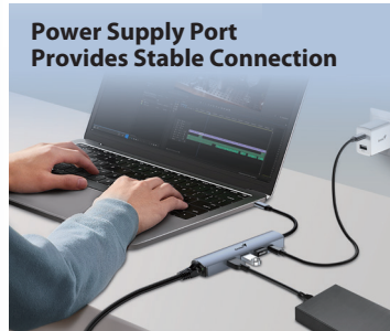
Power Supply Port Provides Stable Connection