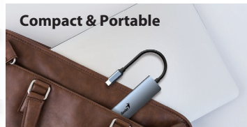
Compact & Portable

Compatible with most of USB devices likes: mouse, keyboard, flash driver, Gaming Console and RJ45 Ethernet